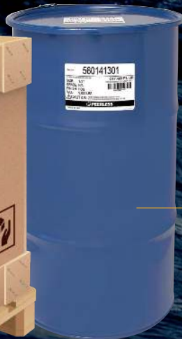
560141301 55 Gallon Drum

USA hallmark is stamped on every link of chain